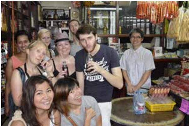
The Village of Love Tour

Fall in love and explore the flavors, spices and aromas of the city's Village of Love—Bangrak. Experience life, food and shopping as a local, while you enjoy a full range of Thai tastes complimented by intimate stories of the neighborhood and Thai history. Our local experts have hand-picked food that is guaranteed to delight. Stories of Bangkok and Thailand's everyday culture will fill your minds with amazement. Join us in exploring the city's authentic off-the-beaten-path landmarks in the Village of Love!