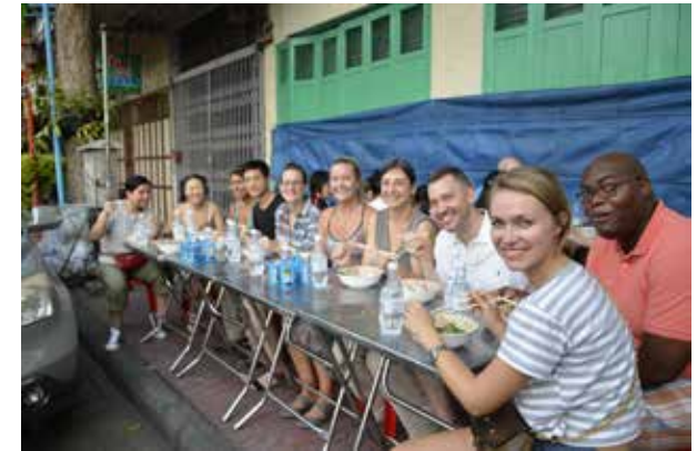
Evening Chinatown Food Crawl

Experience the Village of Love at Night! This tour features many of the stops on our award-winning Village of Love Tour, plus a few new stops as the evening cools down and the streets of the Bangrak neighborhood come alive with all new tastes to savour!