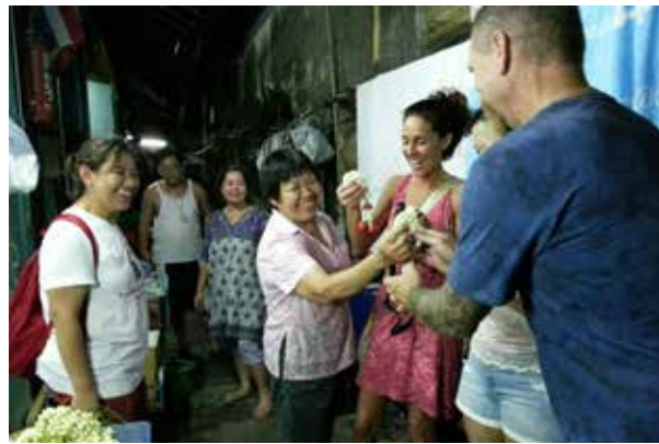
The Village of Love Evening Tour

Fall in love and explore the flavors, spices and aromas of the city's Village of Love—Bangrak. Experience life, food and shopping as a local, while you enjoy a full range of Thai tastes complimented by intimate stories of the neighborhood and Thai history. Our local experts have hand-picked food that is guaranteed to delight. Stories of Bangkok and Thailand's everyday culture will fill your minds with amazement. Join us in exploring the city's authentic off-the-beaten-path landmarks in the Village of Love!